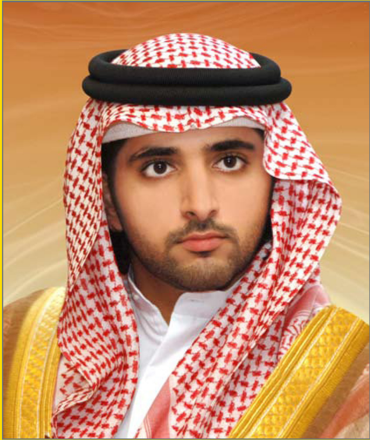
H.H. Shaikh Hamdan Bin Mohammed Bin Rashid Al Maktoum Dubai Crown Prince and Chairman of the Executive Council