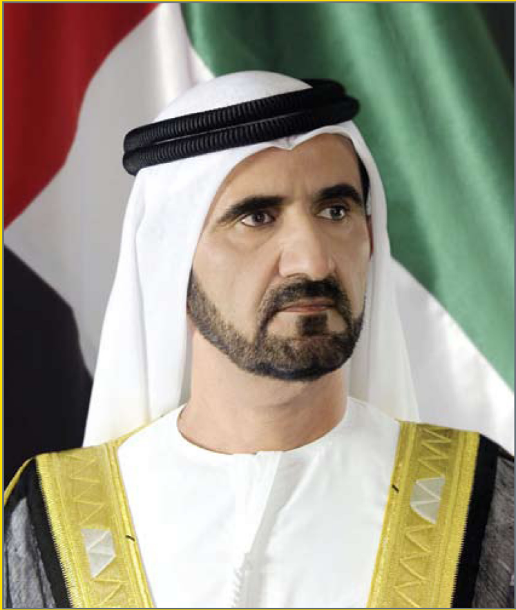
H.H. Shaikh Mohammed Bin Rashid Al Maktoum Vice-President and Prime Minister of the UAE and Ruler of Dubai