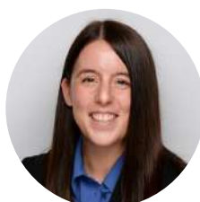
Ms Sarah Wright Middle School